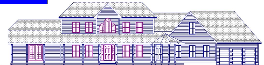
Front Elevation View

3,796 SQ Ft 5 Bedrooms 4 1/2 Baths 3 Car Garage