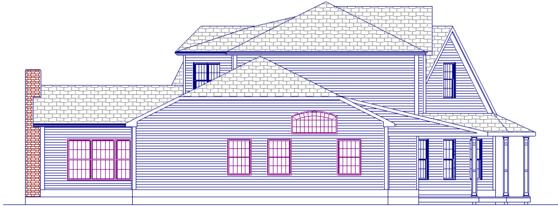
Left Side Elevation View

a division of Jenmar International, LLC.