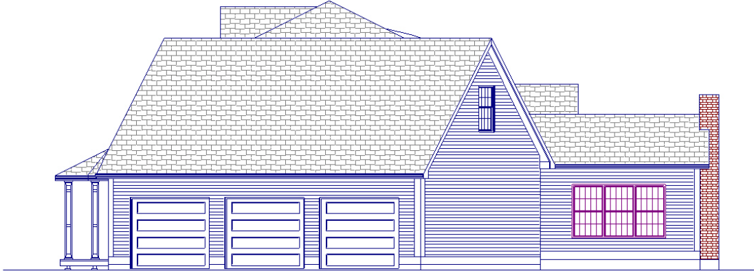
Right Side Elevation View

244 Upton Road Colchester, CT 06415 1-888-820-0409 www.JenmarAuctions.com