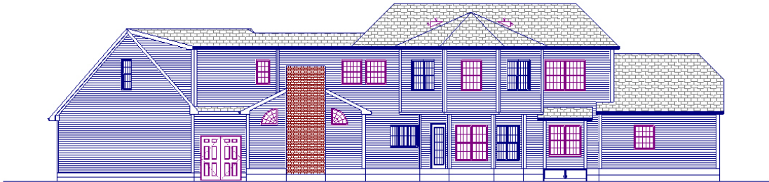
Rear Elevation View